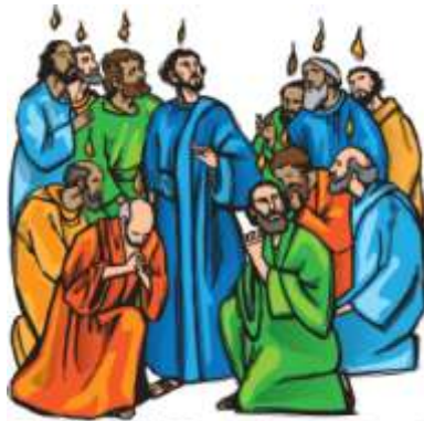
The Holy Spirit Descends on Pentecost

It challenges me to think about the life of the believers here at St. Paul. We have representation from a variety of European, African, and West Indian countries among many others. Can you imagine what it would be like if we all made a concerted effort to be on one accord? Interestingly the unification allowed for the expression of separate native identities. In other words, the Spirit allowed for the expression of each country to be heard, individually, but in unity--each individual language,