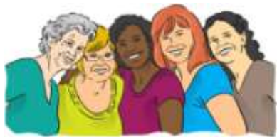
United Methodist Women

Many thanks for your generosity ($1,061!!) toward the funeral fund offering in April! This will enable the UMW to continue to provide repasts.